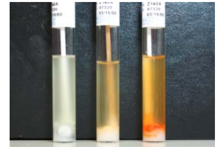
Figure 3. Culture of surveillance swabs in Carrot Broth after 24 h. Results from left to right: GBS negative, GBS positive (slightly orange), GBS positive (orange).