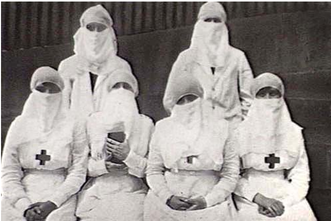
Health care workers in Sydney, Australia, 1918.