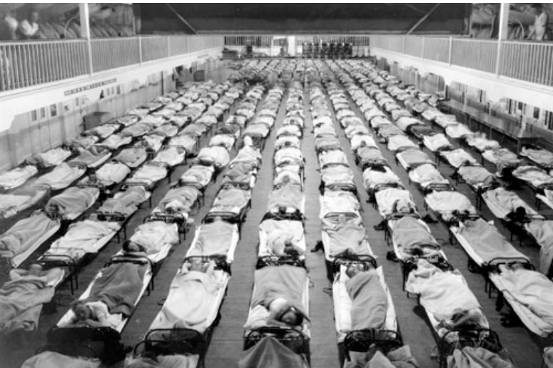
A Dartmouth University gymnasium converted to an infirmary in 1918.

Researchers are reporting that survivors alive today are still producing antibodies to this infamous virus that attacked 90 years ago.