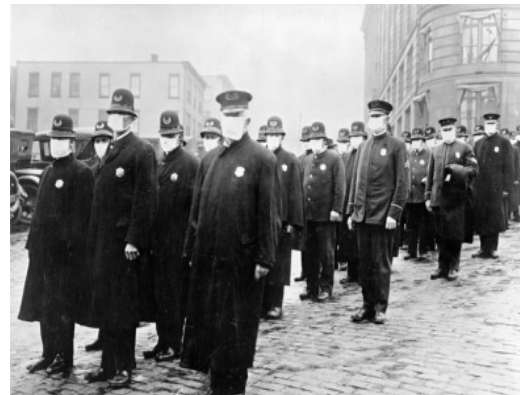
It has been estimated that 50 to 100 million people died from the worldwide Spanish Flu epidemic from 1918 to 1919.

This is the first evidence that shows that people developed significant immunity to the 1918 flu virus.